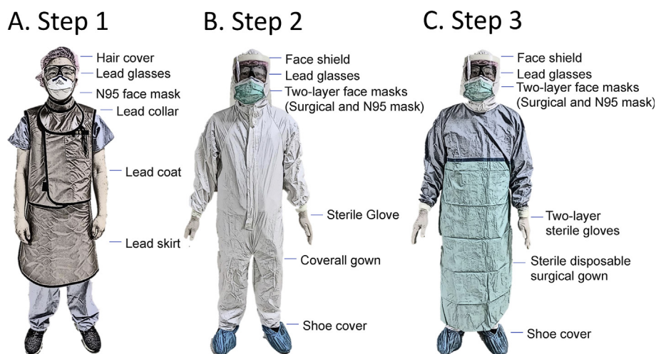
Figure 2 Personal protective equipment suggested in cardiac catheterization lab. The 3 steps were recommended for staffs to wear personal protective equipment in cardiac catheterization. Step 1: Hair cover, lead glasses, collar, coat and skirt were suggested as daily practice. N95 face mask should be worn at this step. Step 2: Face shield, shoe cover, sterile glove and coverall gown were suggested. Two-layer face masks should be worn with surgical on N95 face masks. Step 3: Disposable surgical gown and two-layer sterile gloves were suggested.

AMI: Acute myocardial infarction; COVID-19: coronavirus disease 2019; NSTEMI-ACS Non ST-segment elevation acute coronary syndrome; PCI: percutaneous coronary intervention; SARS-CoV-2: severe acute respiratory syndrome coronavirus 2; STEMI: ST-elevation myocardial infarction.